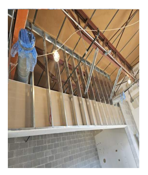
Metal framing installed in serving line area