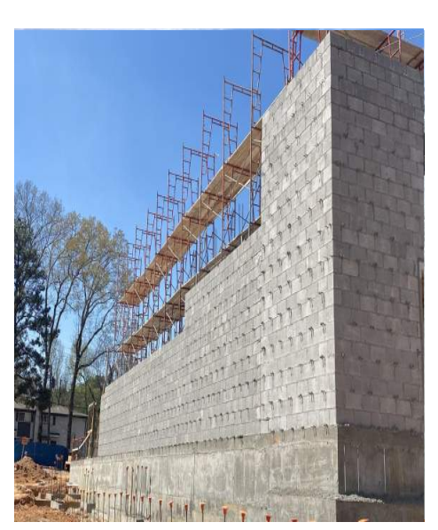
CMU Exterior Walls being installed