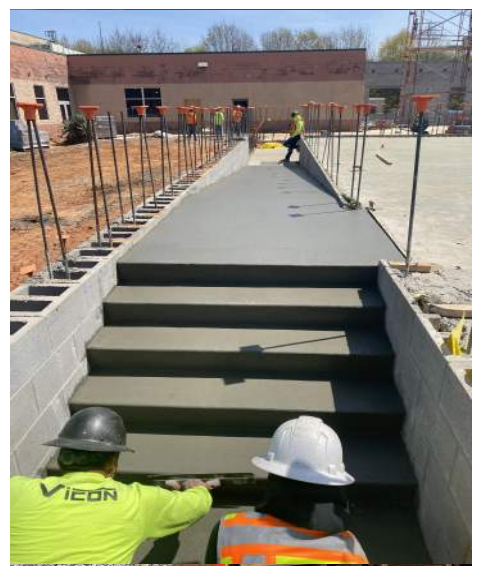
Gym stage ramp and stairs poured